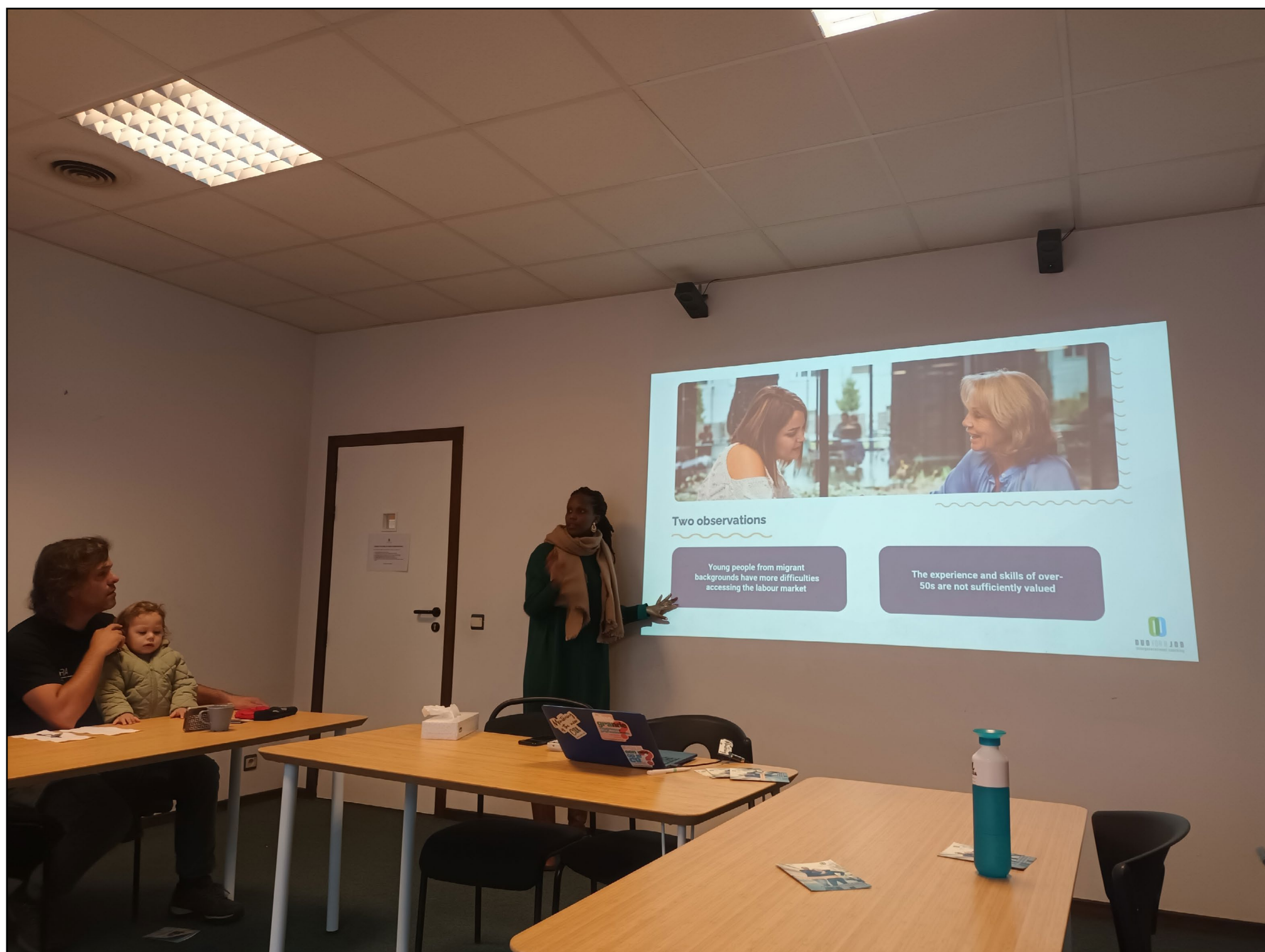
Presentation on the Duo for a Job mentorship program