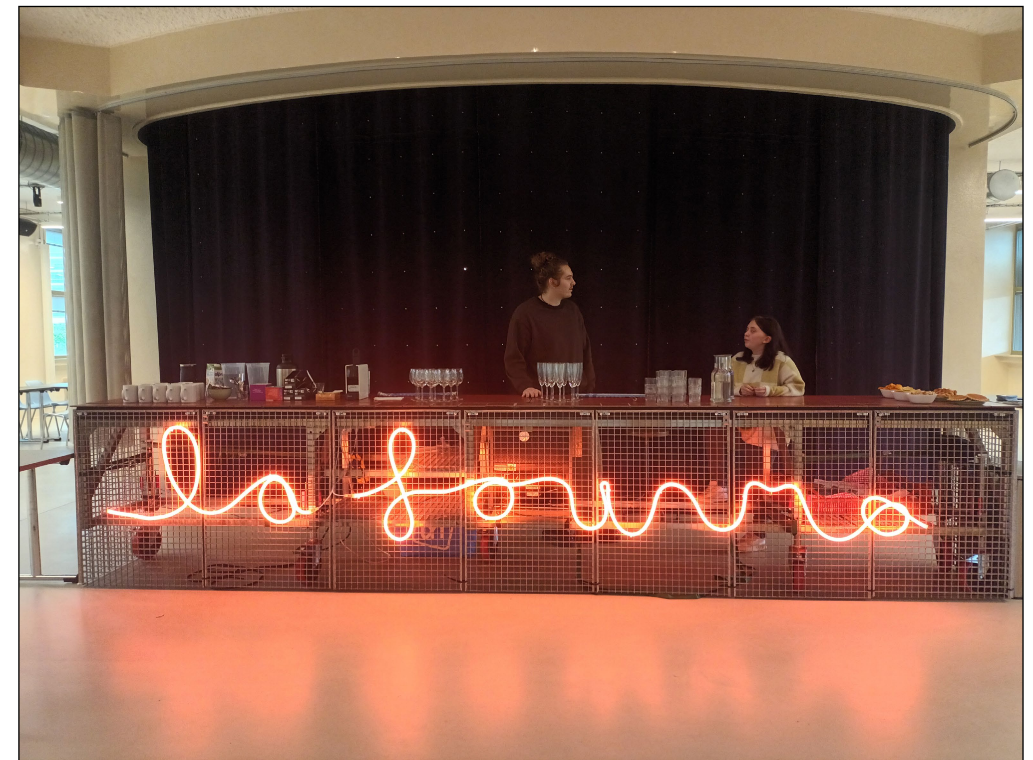
Cooking and socio-cultural project, La Fournu, ready to receive guests