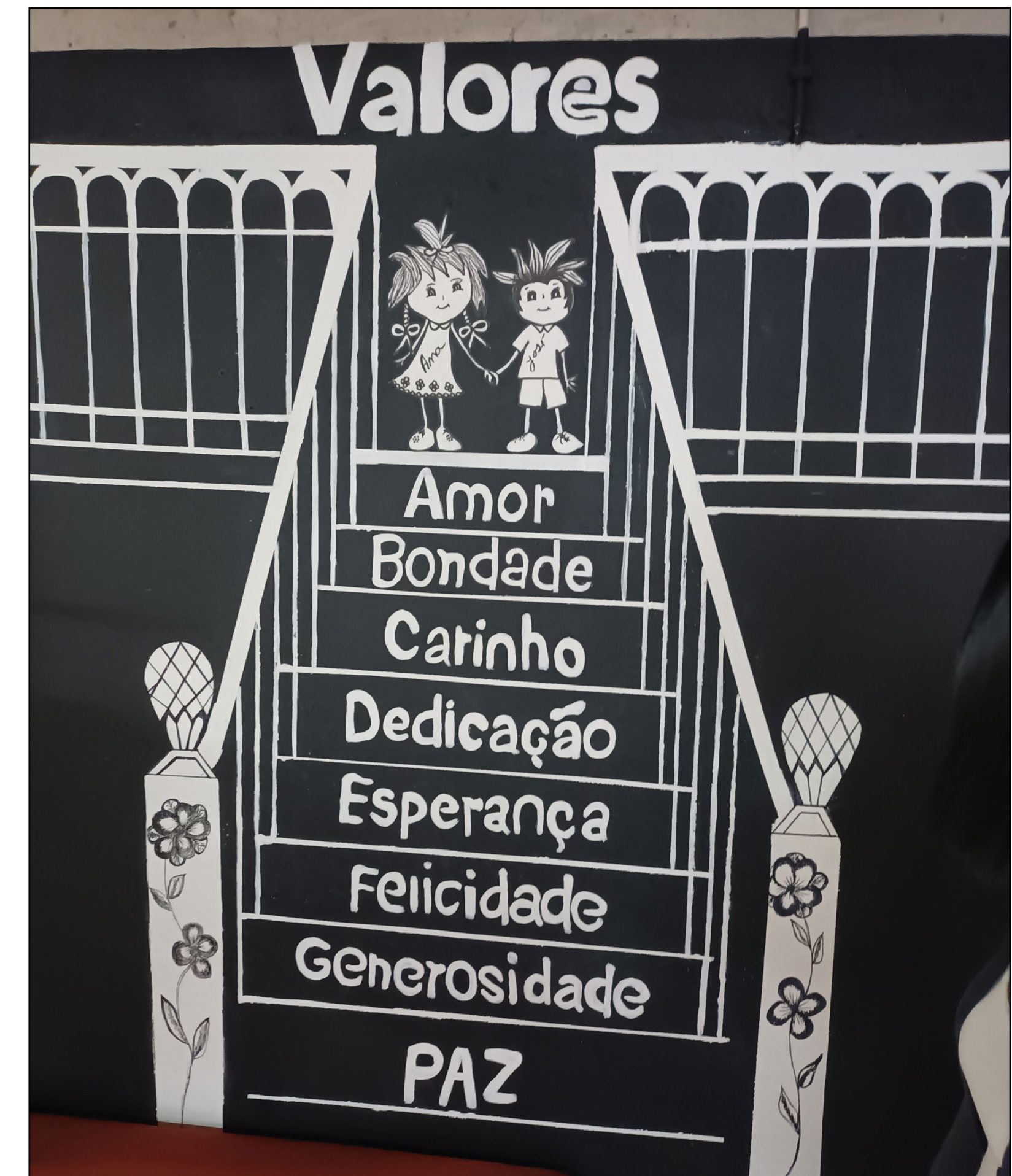
From an education project by Sociohabitafunchal, E.M.

Centro Comunitário Palheiro Ferreiro Sociohabitafunchal is known for successful projects, which are realized by committed individuals. Sociohabitafunchal manages the housing stock of the municipality of Funchal, integrating social inclusion policies and supporting families in need while promoting local economic development. It is committed to conducting demographic studies to support the construction of new homes and analysing related costs. The organization is dedicated to rehousing disadvantaged families, improving housing management, promoting good neighborly relations, and preventing social risks through education. The company also focuses on inclusion through architectural solutions that facilitate mobility and the requalification of the housing stock, including the eradication of asbestos, improving energy efficiency, and enhancing public health. Its comprehensive strategy includes the rehabilitation of public heritage and urban revitalisation while maintaining cultural identity. Finally, Sociohabitafunchal promotes the training of public agents and citizens and ensures the availability of green spaces in housing areas.