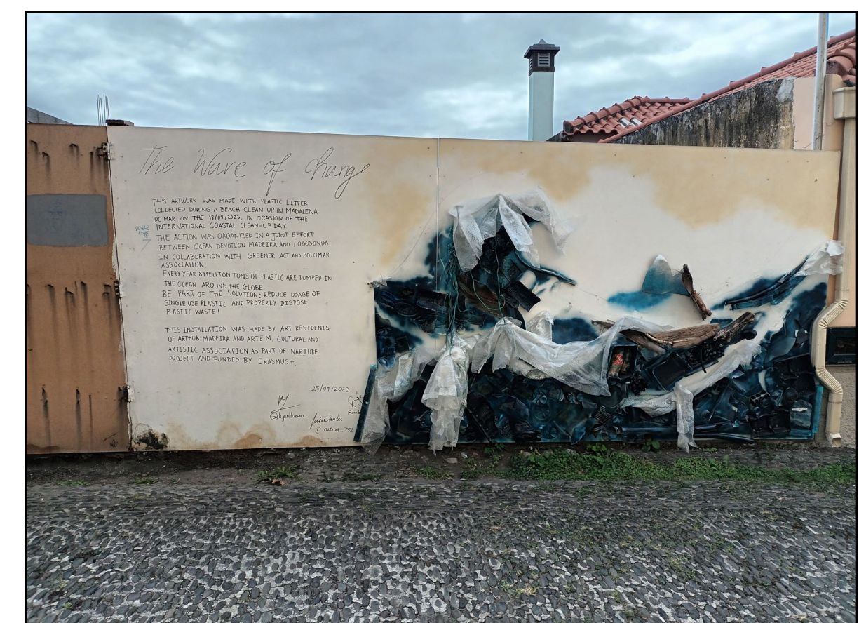
Street art work focused on ecological topics

Unconventional and creative methods are proving to be the most attractive for engaging people: storytelling, placemaking, engagement through art, creative and participatory practices, crafts, shared meals, non-formal education, tours, friendly gatherings, and many other methods are being used by local actors from the civil sector to help solve the social issues that exist in Madeira.