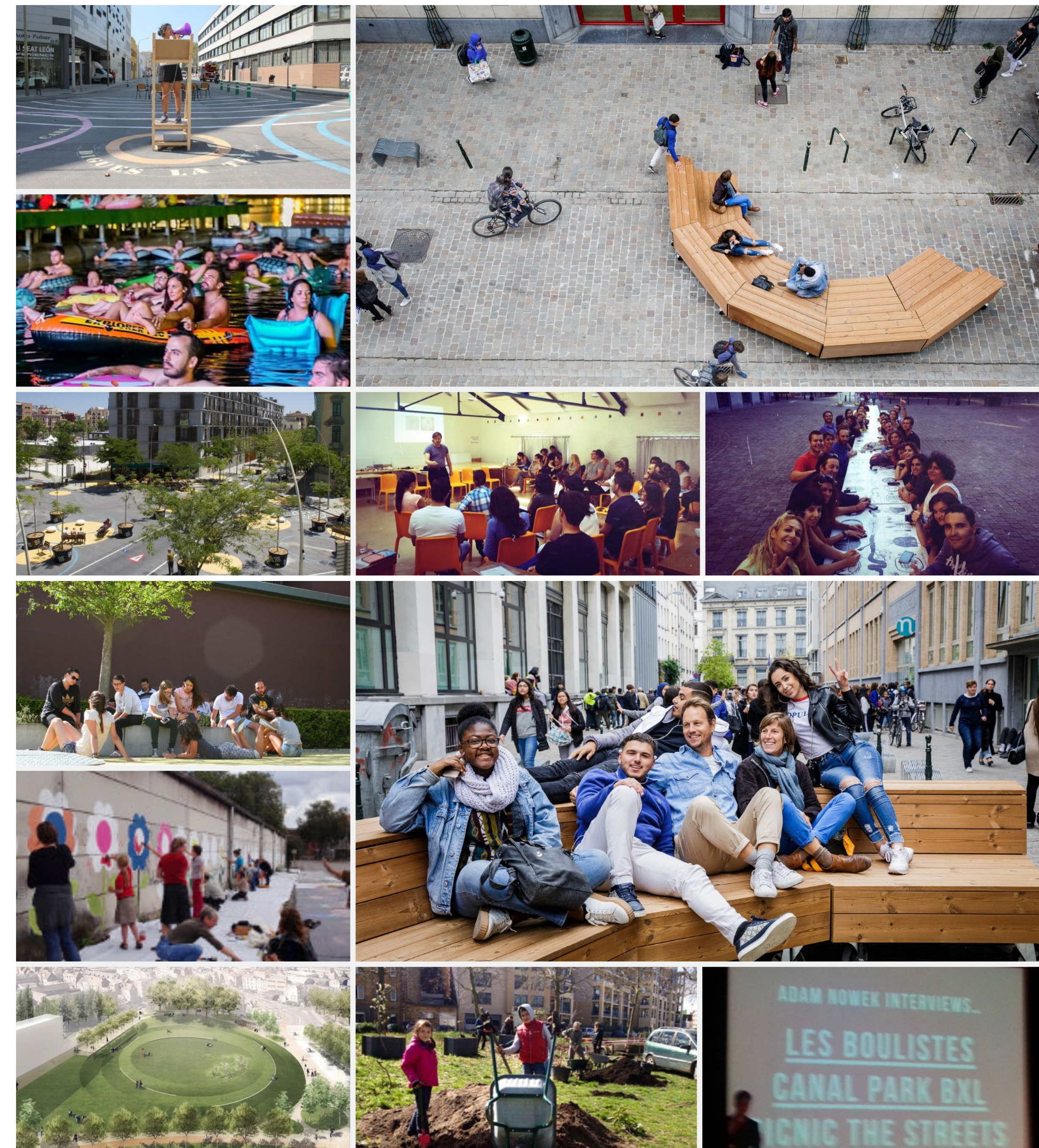
Placemaking projects by Urban Foxes

Youth Empowerment Beyond Involvement: While youth involvement is growing, there is a need for more structured pathways that turn participation into long-term empowerment. This includes providing training, mentorship, and professional development opportunities for young people involved in placemaking.