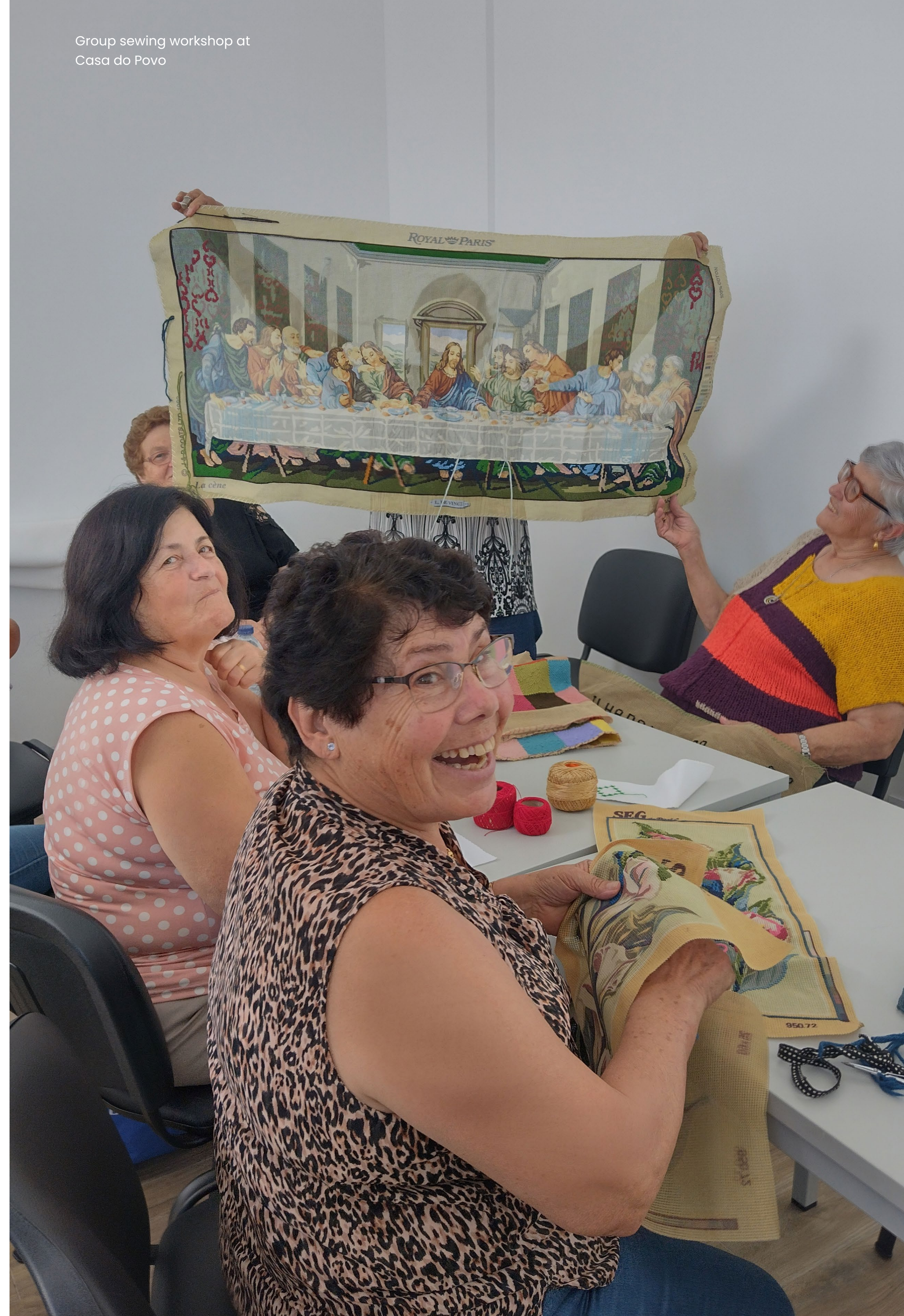
Group sewing workshop at Casa do Povo

Centro Comunitário “VILA VIVA”, Estreito