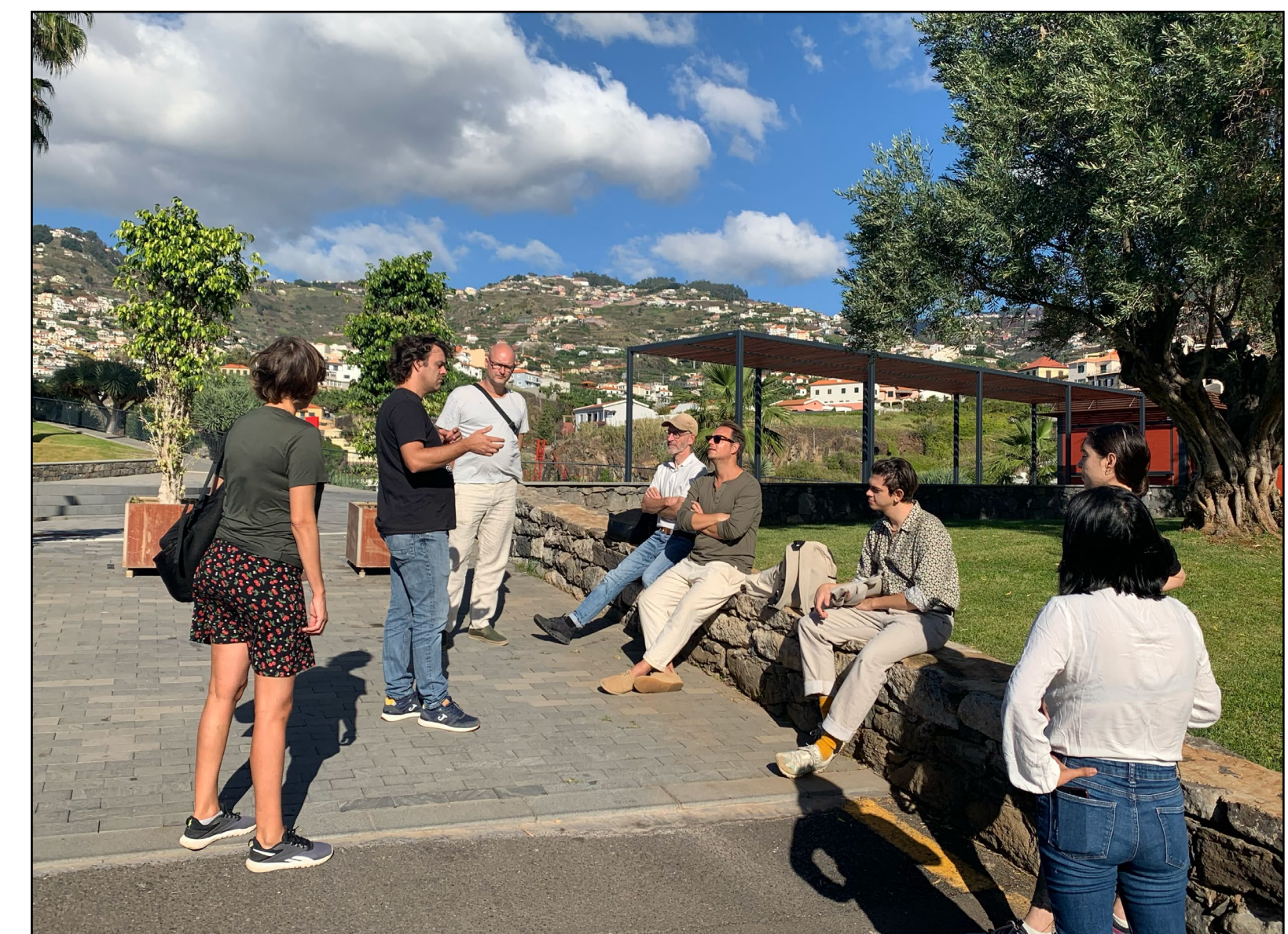
Learning on site about Teatro Metaphora