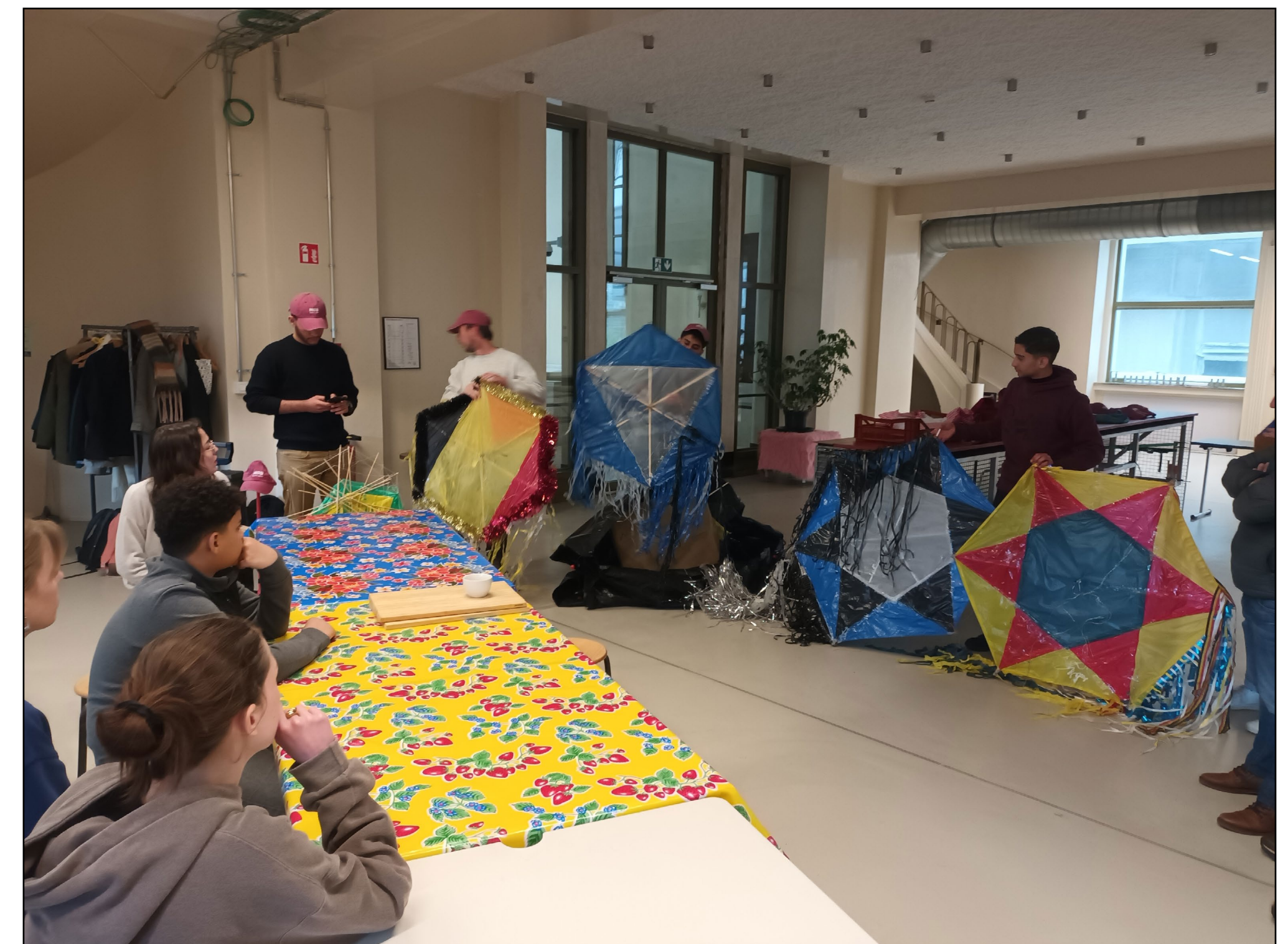
Kite workshop led by young people from the initiative Museums of Belgium