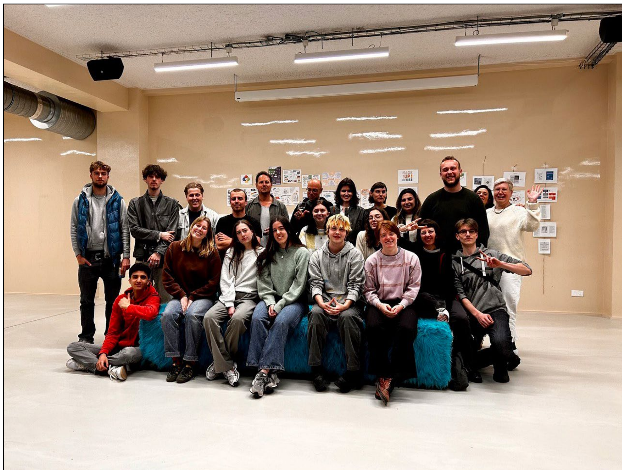
Foto from the results presentation of the project Wake Up! cities focusing on Place-making